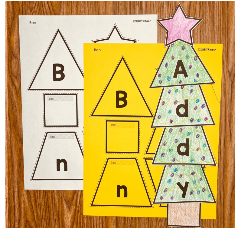
Easy Print And Assemble or Decorate Options