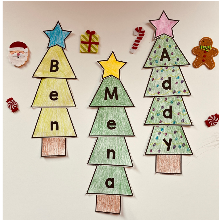
Perfect For Bulletin Board Displays