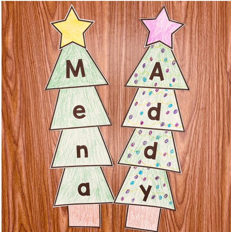
Type In Their Names And See The Magic